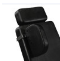
Gazelle PS interior laterals