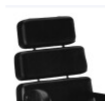
Gazelle PS trunk support extension