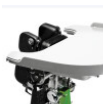
Gazelle PS tray with bowl and cover