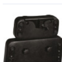
Gazelle PS head support mounting