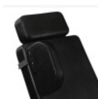
Gazelle PS laterals