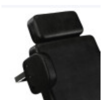
Gazelle PS exterior laterals