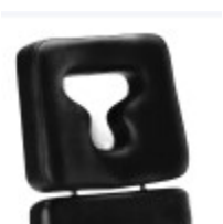
Gazelle PS facial aperture anatomic head support