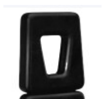
Gazelle PS facial aperture head support