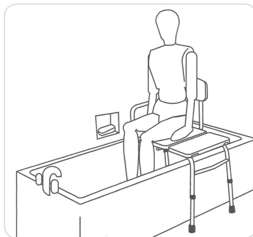
Correct seated position on bath transfer bench.