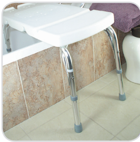
Extra long legs