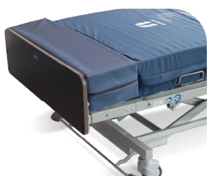
bock® bed extension kit 5066, 5067