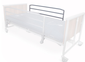
Fold downside rails left/right 910T-L, 910T-R