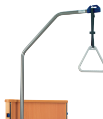
bock® Self-help pole 5113