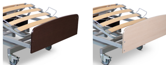
Dark oak endboards and Oyster line endboards

Ergo Plus hand controller is designed for ease of use with fully adjustable mounting clip to allow multi positioning. The integrated disabler function allows all electric functions to be disabled with a simple hand controller lock.