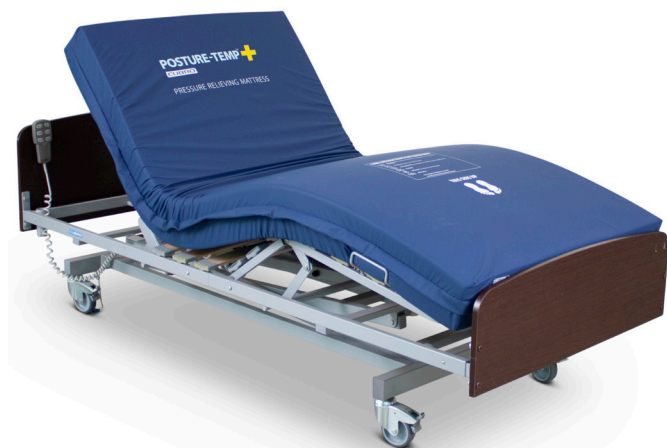
Bock® v2 electric bed with Dark oak endboards