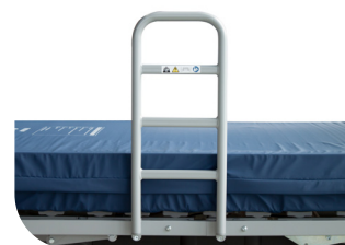
Clamp-on side support rail 5109-2