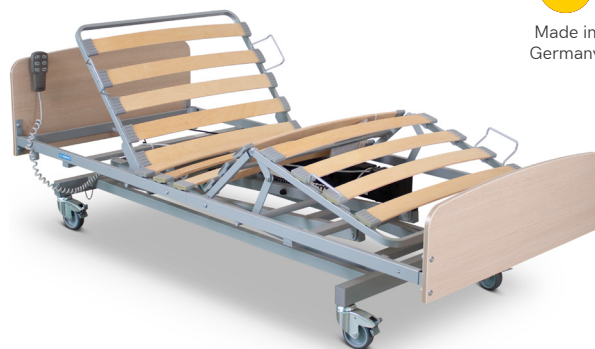
4-section bed movement

A range of optional extras are available.