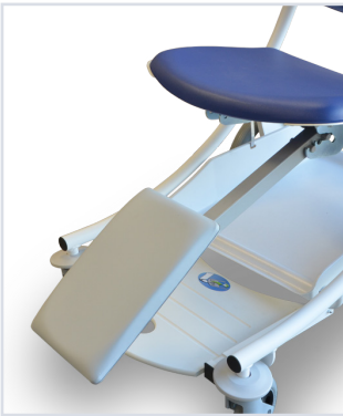
Adjustable legrest (each)