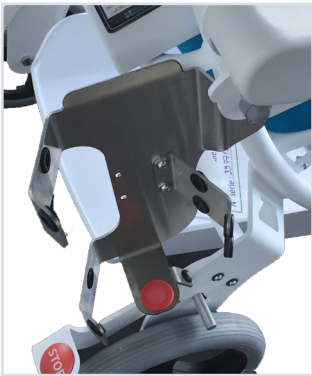
Oxygen cylinder holder