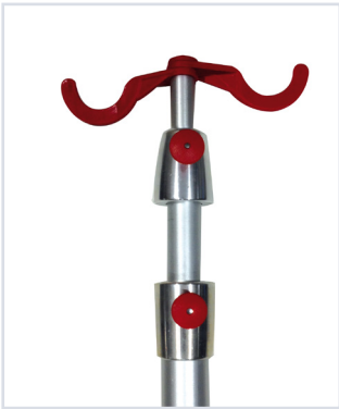
Removable IV pole with 2 hooks