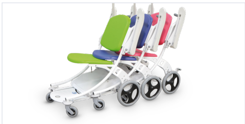
Stacks for compact storage